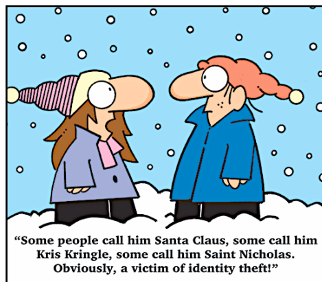
"Some people call him Santa Claus, some call him Kris Kringle, some call him Saint Nicholas. Obviously, a victim of identity theft!"